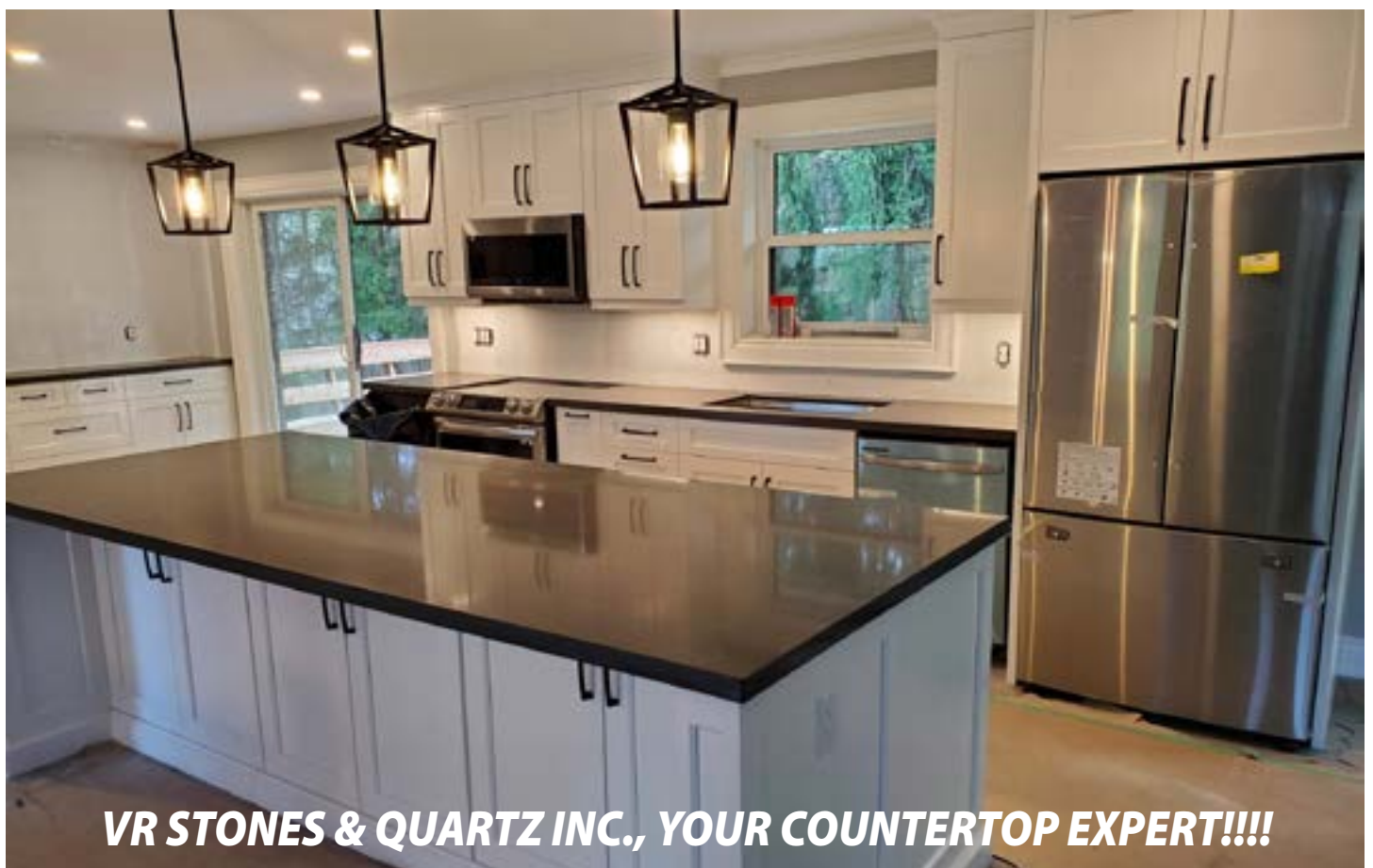
VR STONES & QUARTZ INC., YOUR COUNTERTOP EXPERT!!!!

Our clients include both residential and commercial customers, as well as builders and designers. For all your countertop needs, please feel free to call us and experience what all our satisfied clients have experienced from us!