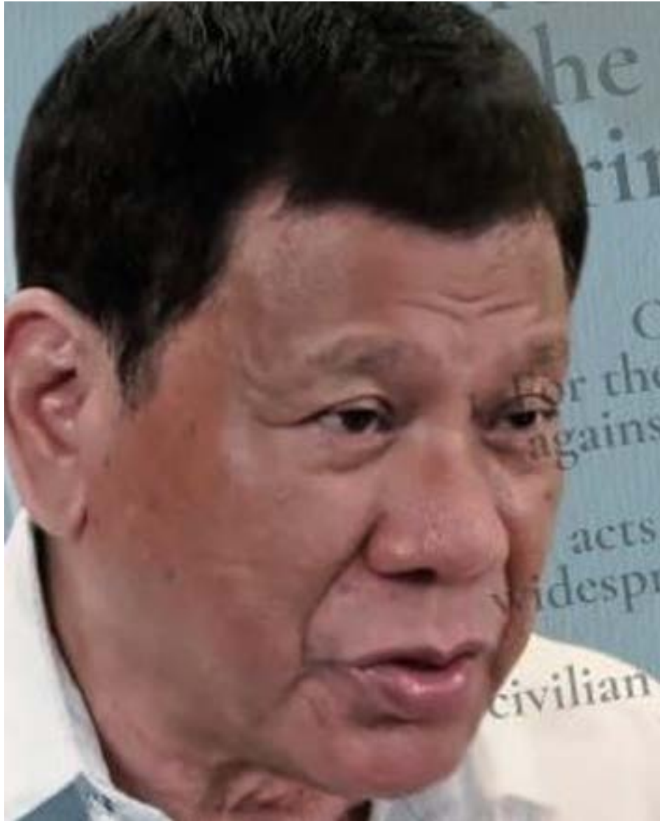
Ang dating pangulo ng Pilipinas na si Rodrigo Duterte noong Nobyembre 2024

May mga grupo na ipinanawagan sa ICC na ipaaresto ang ibang co-perpetrators ni Duterte.