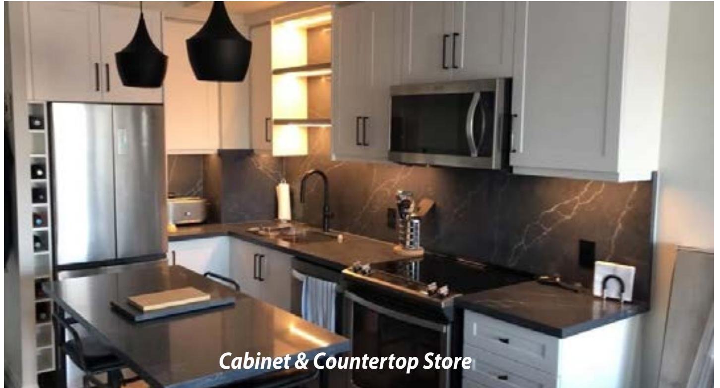
Cabinet & Countertop Store

At VR Stones & Quartz Inc., we personally involved in every project from the beginning stages of planning to final installation, ensuring the results you see at completion are exactly what you envisioned. We take a hands-on, individual approach to work with each of our clients, focus on the quality, superior service and client satisfaction.